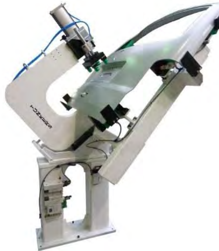
Piercing of 4 holes SW 9,0 mm in 0,8 mm thick steel sheet